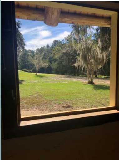
Outside view from inside the Friary of Mission San Luis.