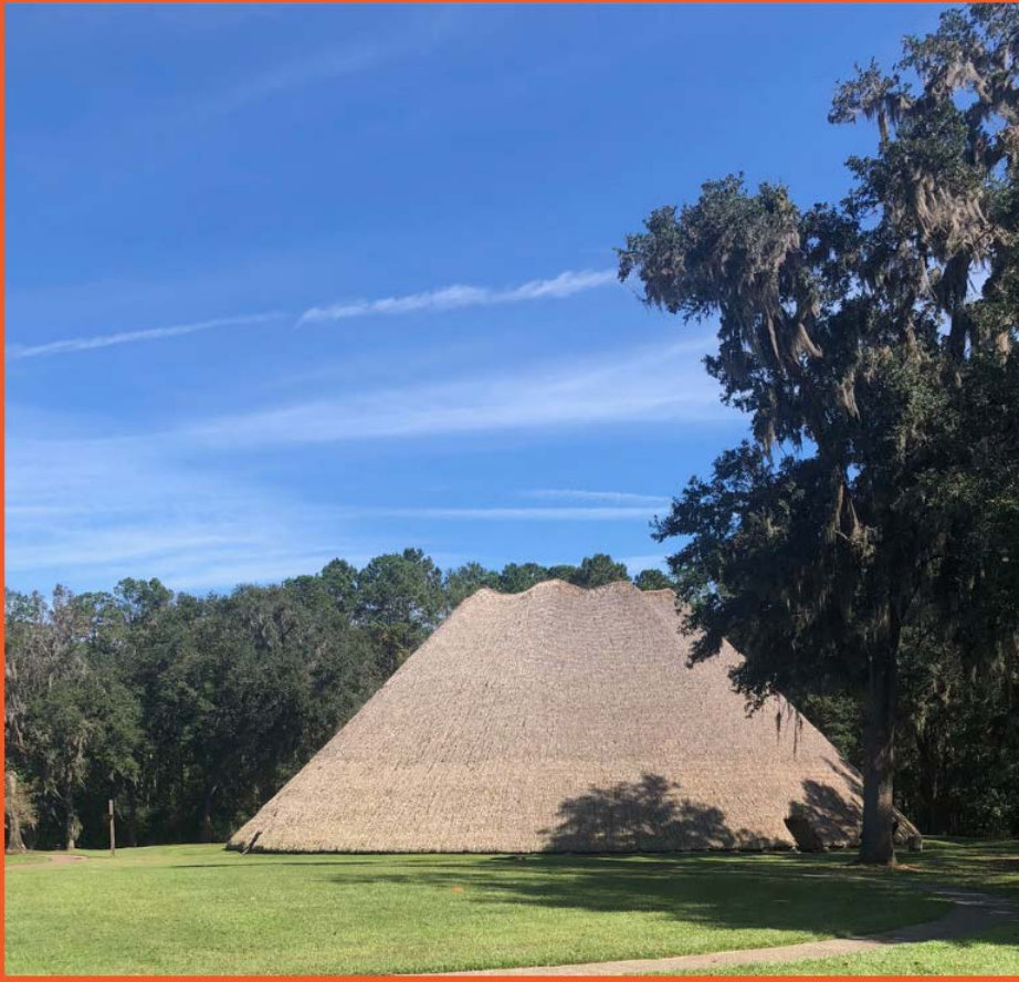
Exterior view of Council House at Mission San Luis.