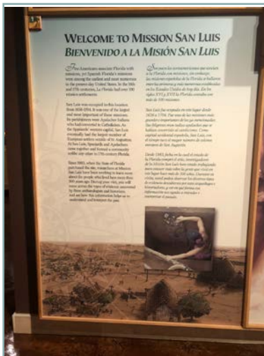
Inside the exhibit gallery of Mission San Luis.