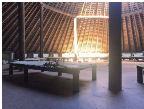
Inside the Council House of Mission San Luis.

Mission San Luis offers education programs on site and internet resources for teachers wanting to enrich their curriculum in culture lessons. The lessons meet the Next Generation Sunshine State Standards.