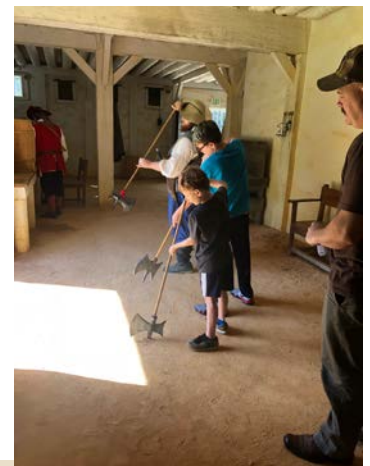
Inside the Fort of Mission San Luis.