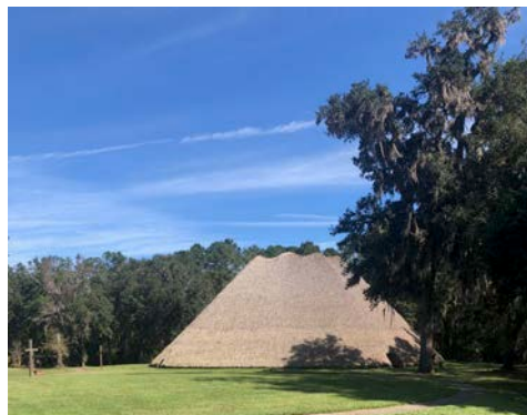
Exterior view of the Council House at Mission San Luis.

The Council House can fit over 1,000 people within. Travelers would stay here when they visited in small spaces along the inside of the house. The outer spaces were for the council rulers. The fire pit within the center of the house would expand to about 13 feet wide. Man activities such as dancing and war meetings were done in the council house.